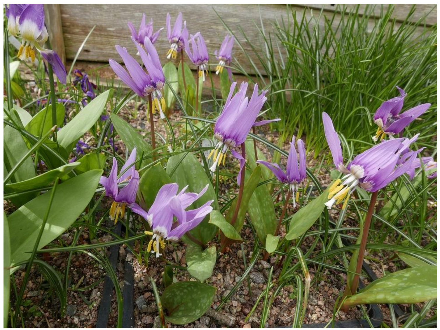
This is a different form from the complex which I believe is Erythronium sibiricum ( sibiricum ), it is very easy to separate from the form that I refer to as E. krylovii even from a distance.