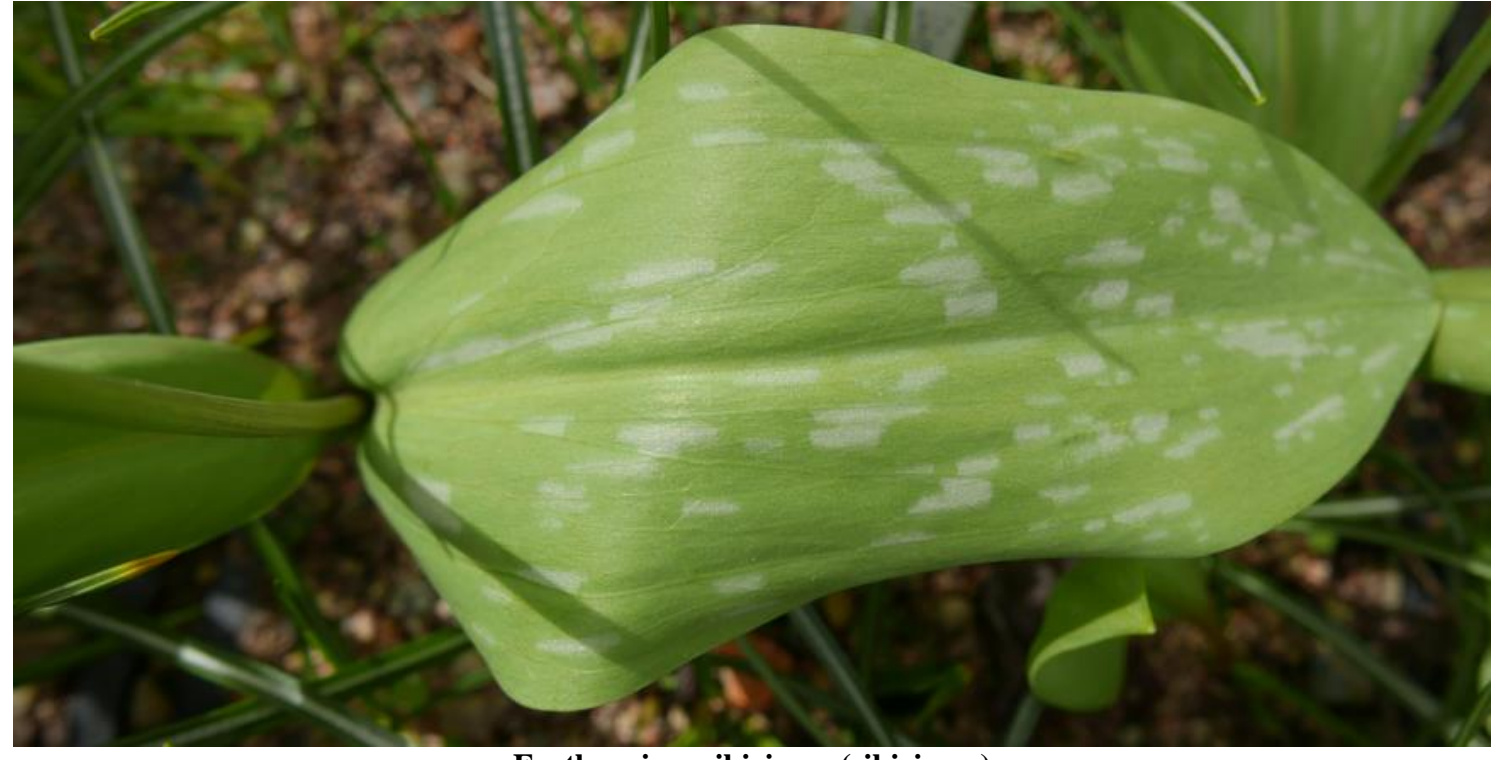
Erythronium sibiricum (sibiricum)

The following pictures illustrate that their leaves differ in shape also those of Erythronium sibiricum (sibiricum) have varying degrees of markings while those of krylovii are plain green.