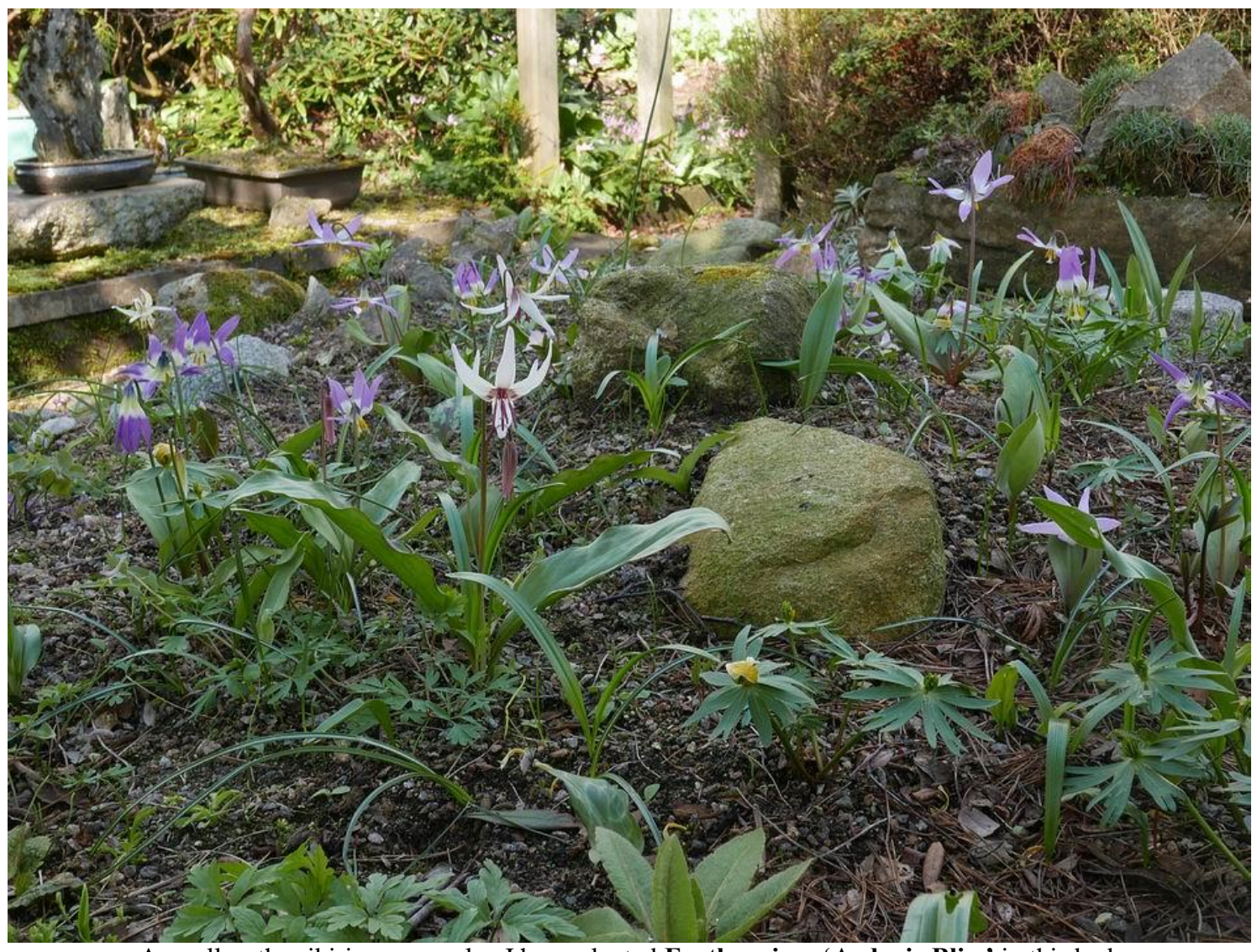
As well as the sibiricum complex I have planted Erythronium 'Ardovie Bliss' in this bed.