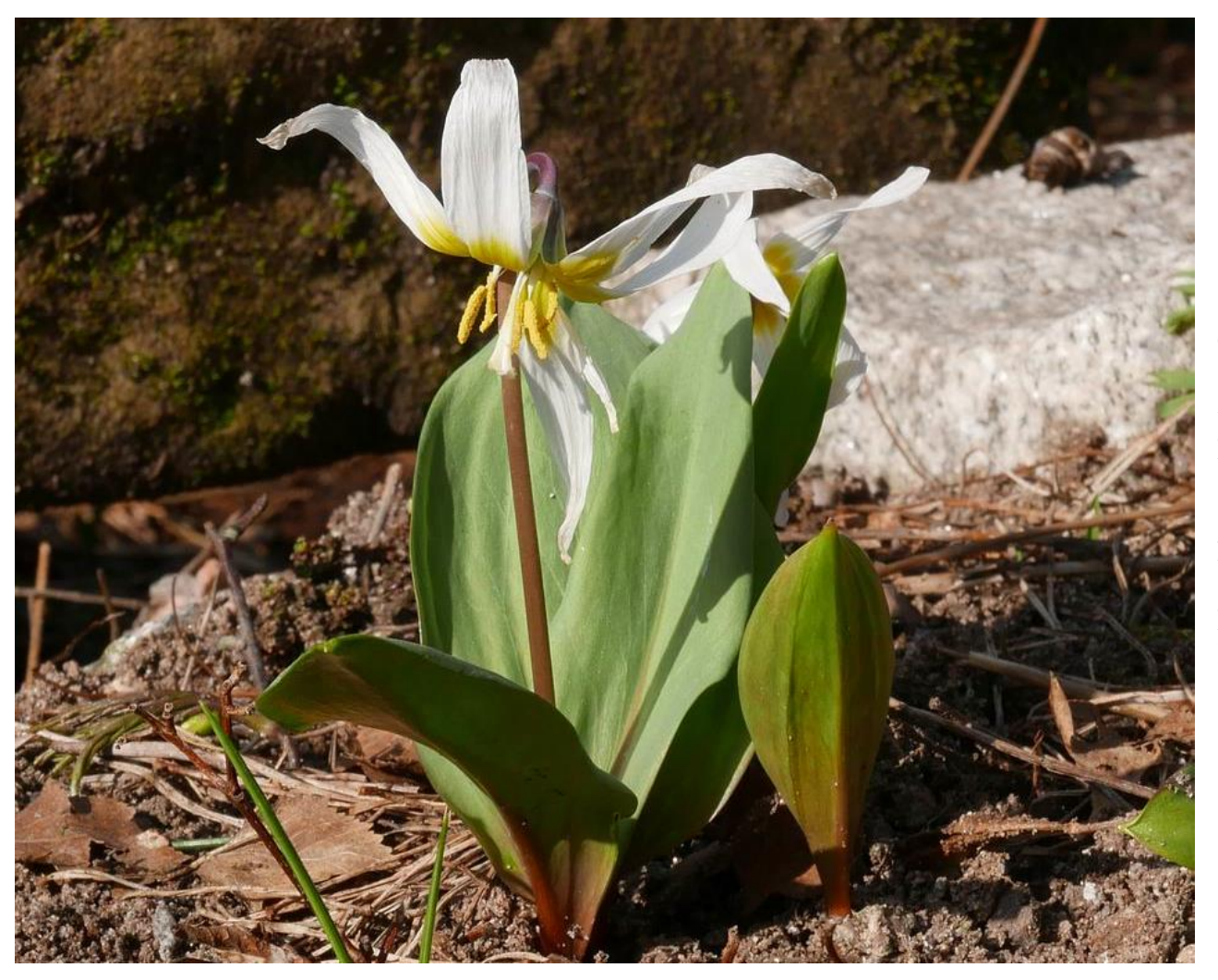
This is the white form of the Erythronium sibiricum complex that has been described as Erythronium krylovii.