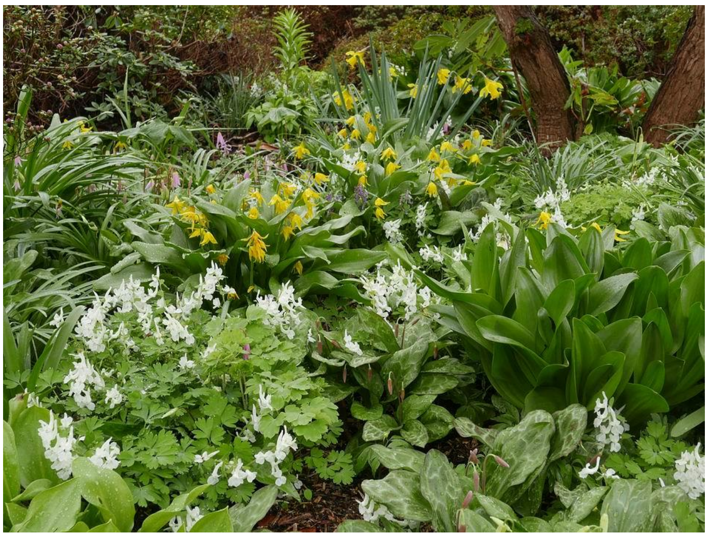
The early flowering Erythronium tuolumnense overlaps with Corydalis and Narcissus joined below by the pink Erythronium revolutum.