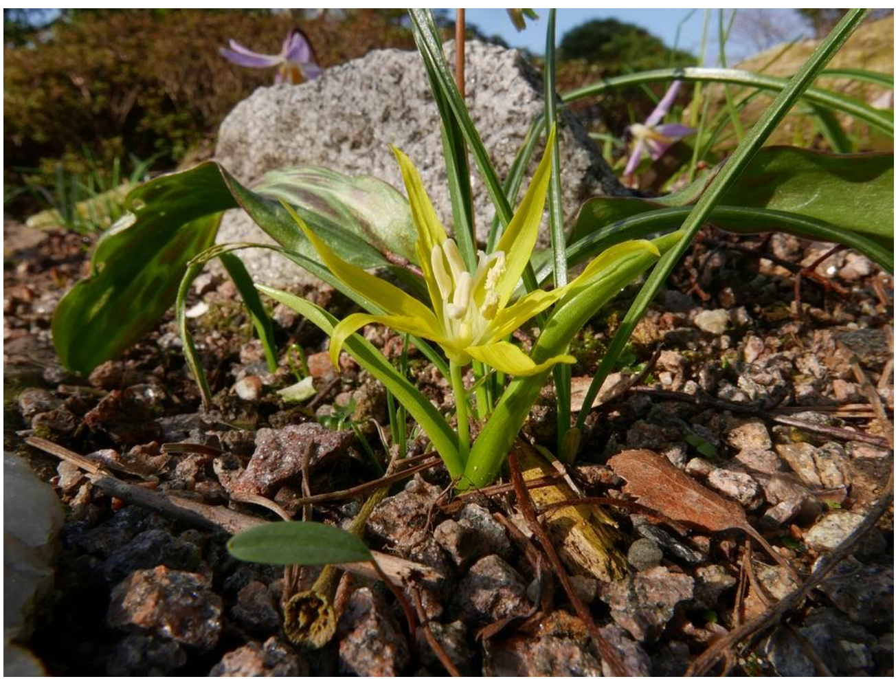
Another mystery is this Erythronium aff. grandiflorum from Mount Prevost BC – my observations of the plants I have grown from seed suggest to me that it is sufficiently distinct to be a new species or at least a subspecies.