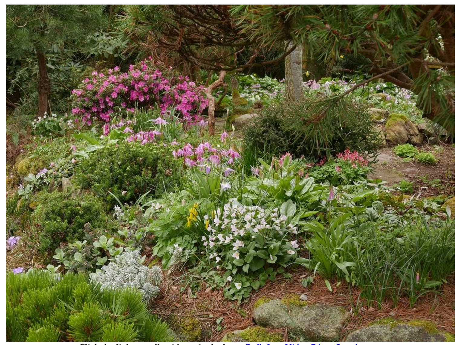
Click the link to walk with me in the latest <u>Bulb Log Video Diary Supplement</u>

I will finish off this week's Bulb Log with a couple of views across the raised wall where there is so much colour with new flowers opening every day.