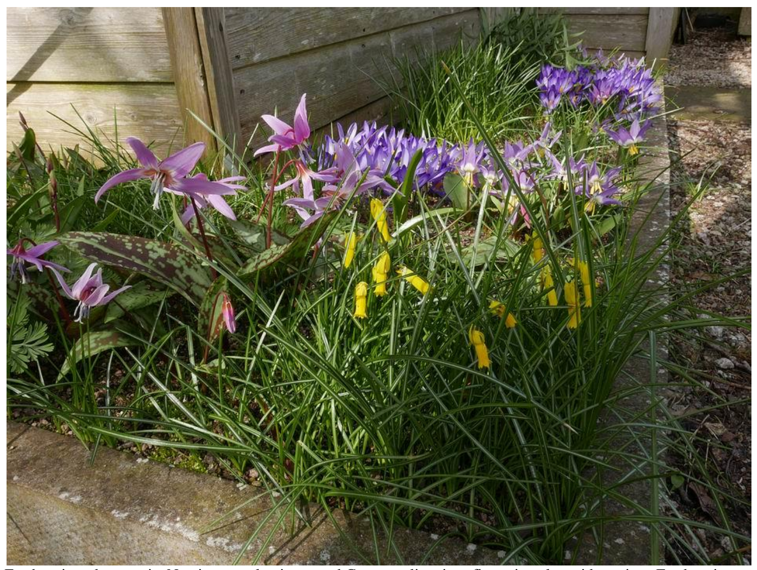
Erythronium dens-canis, Narcissus cyclamineus and Crocus pelistericus flowering alongside various Erythronium sibiricum