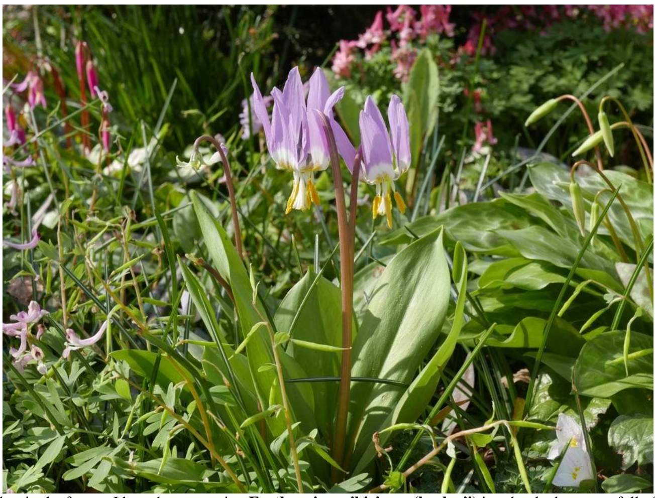
As well as in the frames I have been growing Erythronium sibiricum ( krylovii ) in other beds successfully for a few years now, also Erythronium japonicum below.