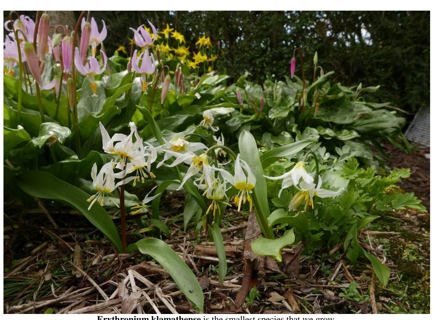
Erythronium klamathense is the smallest species that we grow.