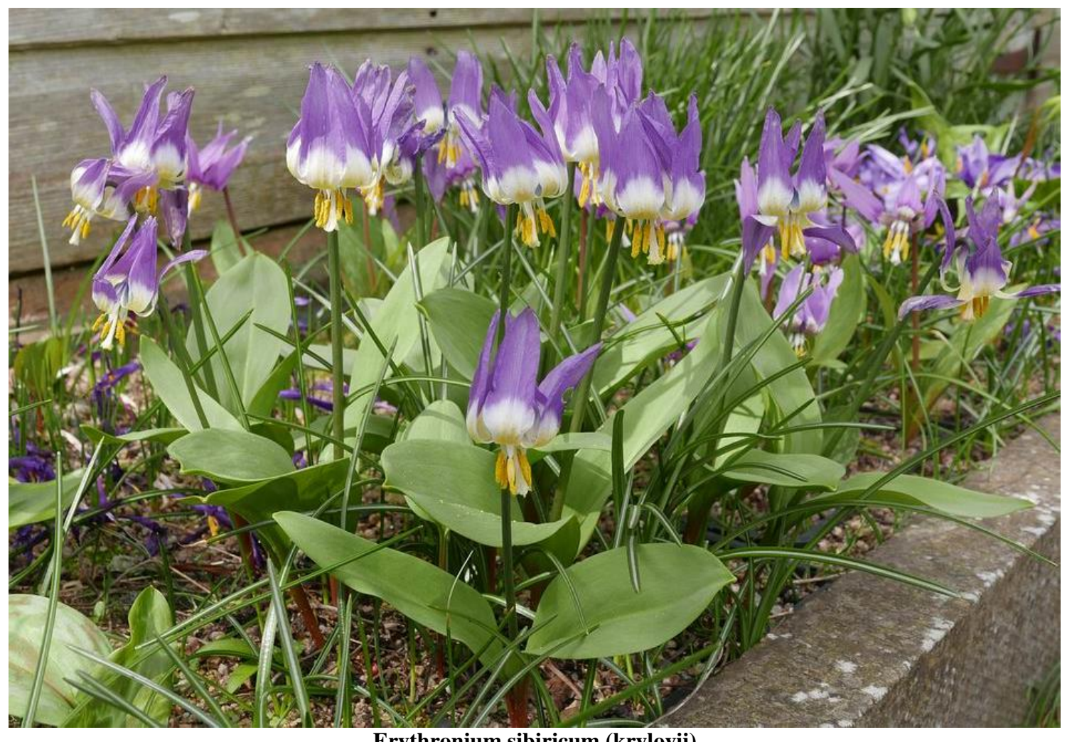
Erythronium sibiricum (krylovii)

There are a number of different species hiding in the Erythronium sibiricum complex this is the one that I thought was being called Erythronium krylovii before a paper was published that stated that it had only white flowers - and now I am not clear!