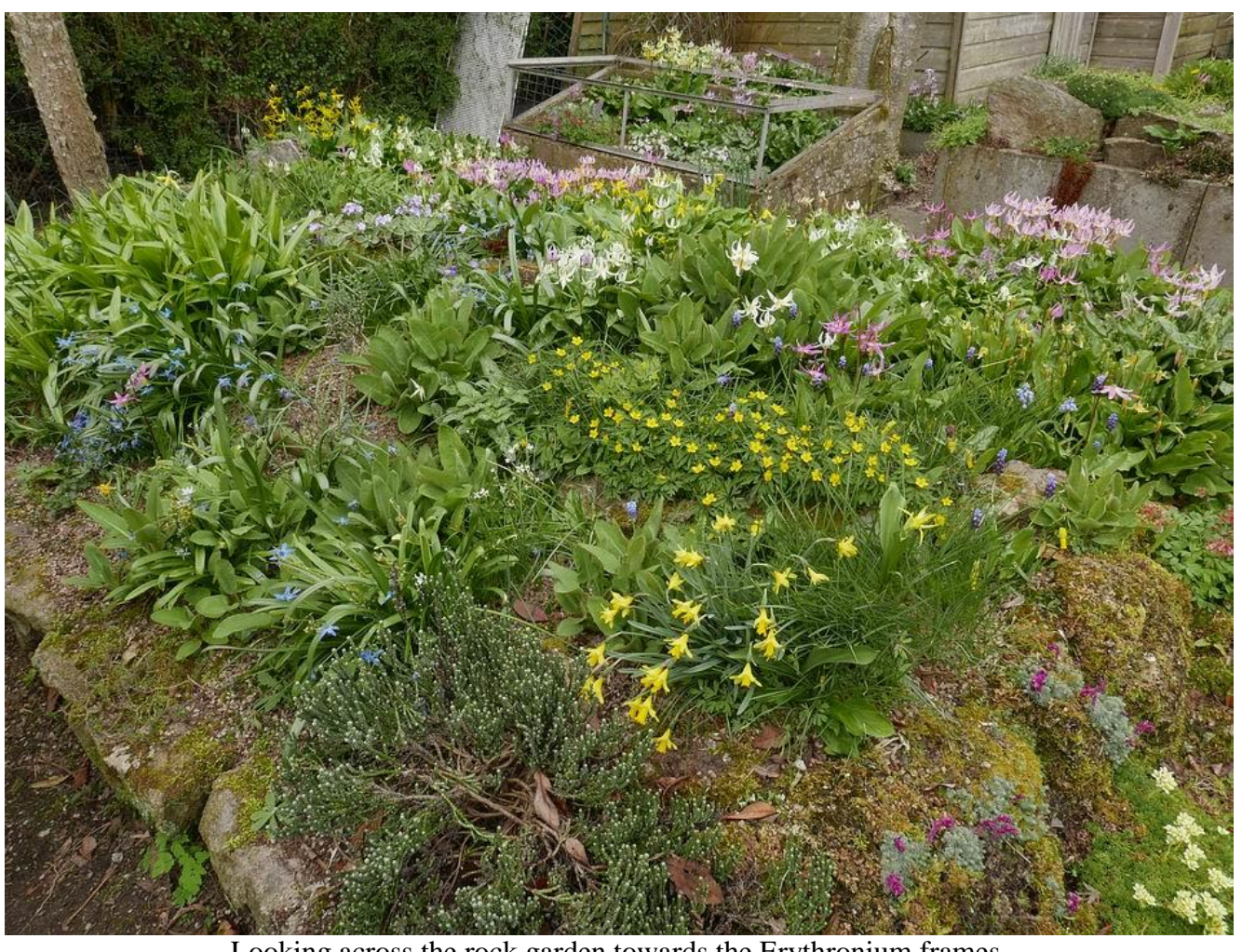
Looking across the rock garden towards the Erythronium frames.