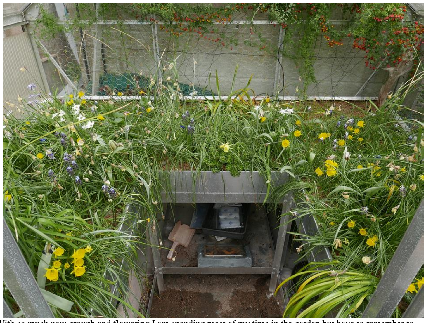
With so much new growth and flowering I am spending most of my time in the garden but have to remember to water and feed the plants in the bulb house pots and sand beds where there is still plenty of flower.