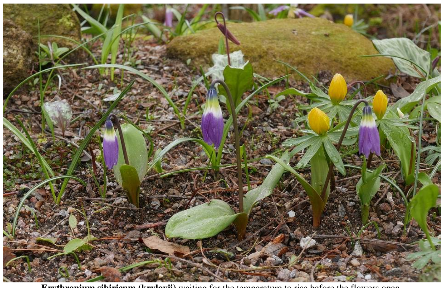
Erythronium sibiricum (krylovii) waiting for the temperature to rise before the flowers open.