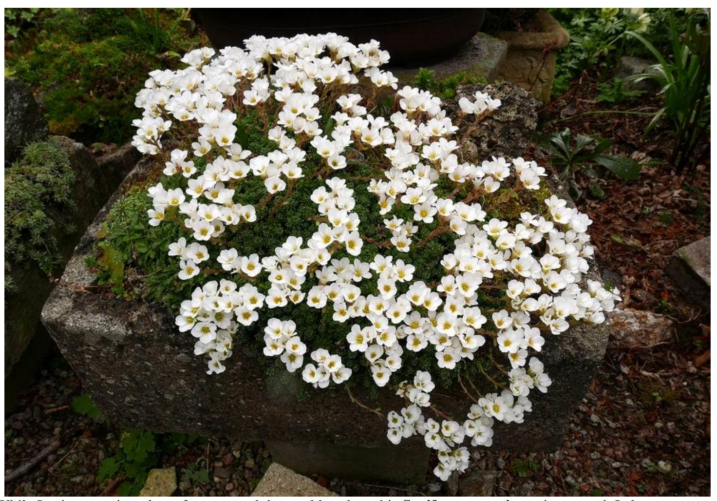
While I enjoy growing plants from around the world such as this Saxifraga marginata in a trough I also get great pleasure from exploring our own flora such as Cochlearia officinalis, below, which is equally attractive growing in a raised bed. We also grow Cochlearia danica and I think that they may be hybridising in the garden.