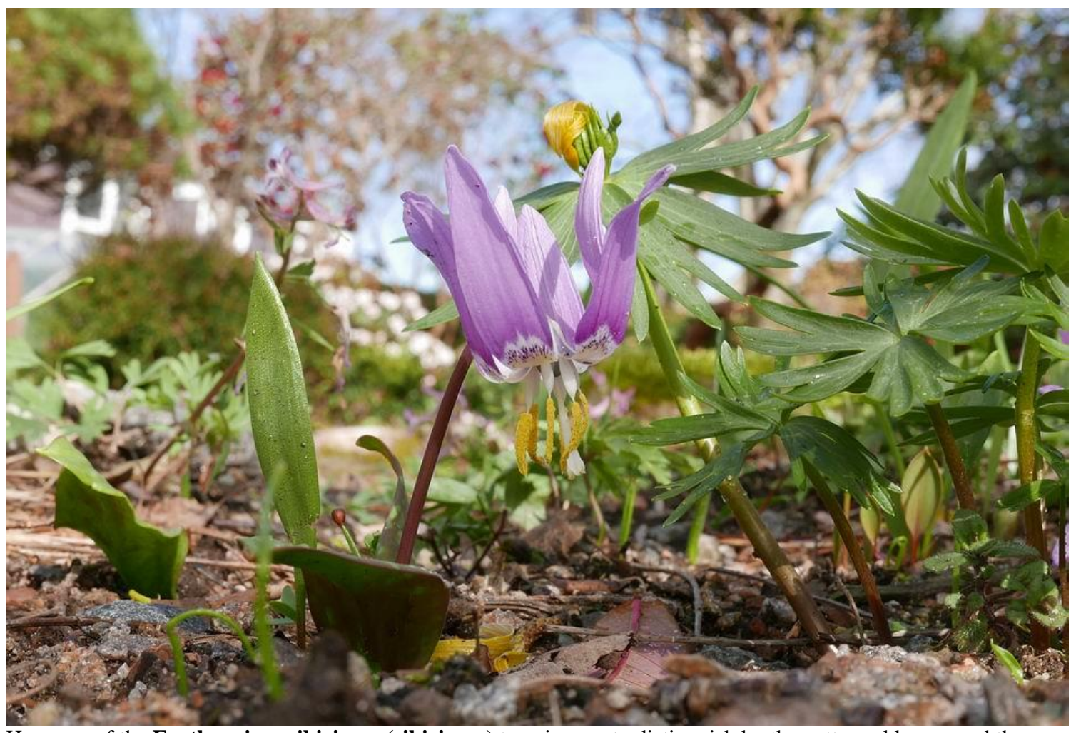
Here one of the Erythronium sibiricum ( sibiricum ) type is easy to distinguish by the patterned leaves and the flower shape markings