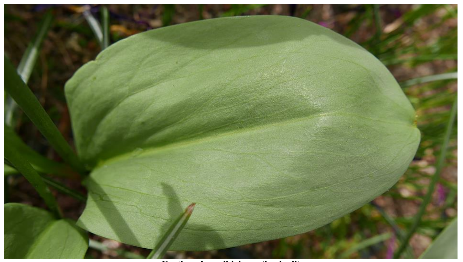
Erythronium sibiricum (krylovii)