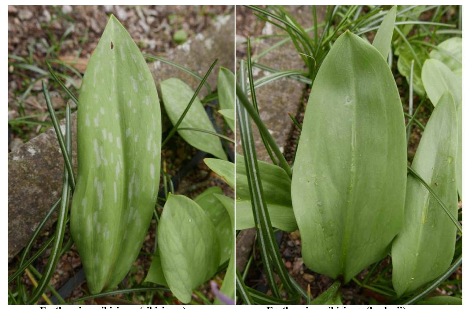
Erythronium sibiricum (sibiricum)