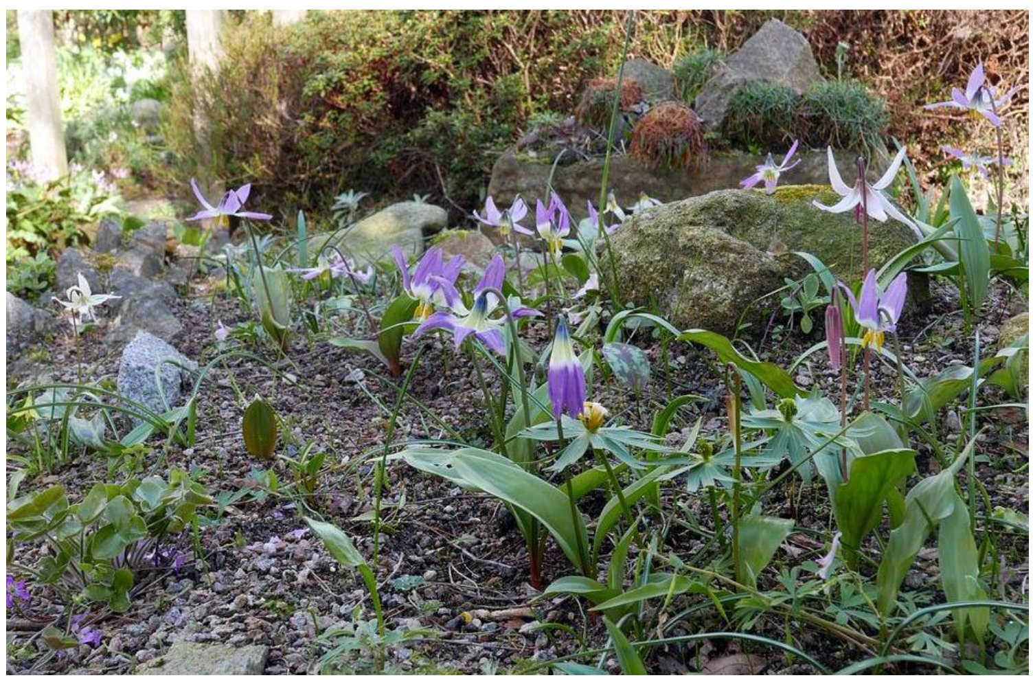
Erythroniums from the sibiricum complex growing happily in the new bed where I will encourage them to seed around.