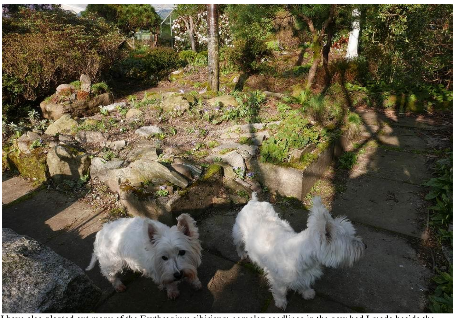
I have also planted out many of the Erythronium sibiricum complex seedlings in the new bed I made beside the pond and now I am excited to see them flowering there.